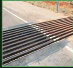
Cattle Grids in various states of disrepair can be repaired using the BRP Road Patch.