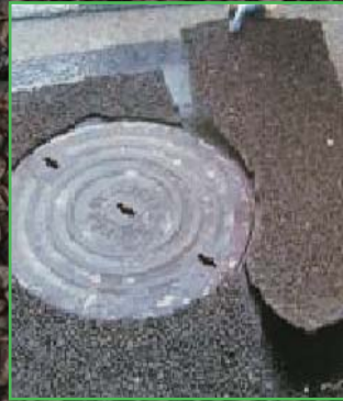
Sealing Utility Repairs