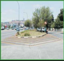
Economic solution to extending kerbs.