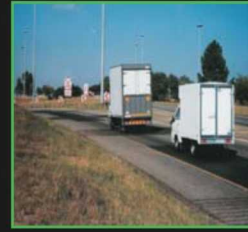
Application Procedures are easy to learn, promoting job creation across board irrespective of gender