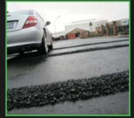
The BRP Road Patch can be layered for unique applications such as BRP Rumble Humps