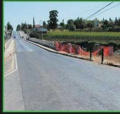
Crack Sealing repairs over a wide area.